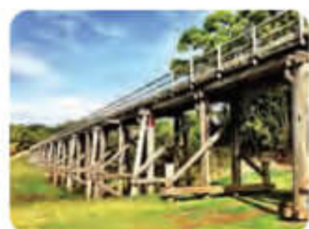
TRESTLE BRIDGE ON CAMPERDOWN/TIMBOON RAIL TRAIL